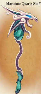
Maritime Quartz Staff

A weapon carved of maritime quartz allows a warrior versed in spellcraft to freely practice the Art on the field of battle.