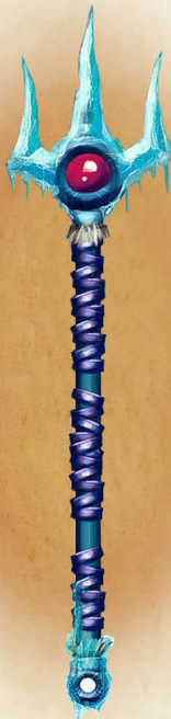
True Ice Trident